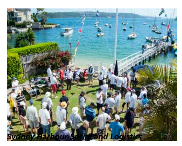
Thursday 5th. Evening. The RPEYC will be hosting welcome drinks. Point Piper

Transport. For those who are staying at Pittwater for the 2 weekends, we will be arranging buses to travel to and from Pittwater and Harbour for the 3 days. Parking at Mosman Bay and Point Piper is very limited. The Pittwater boats will be using this transport. All visitors are welcome to join us. We will need to know numbers and will send out a request form nearer the day.